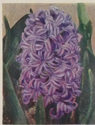
KING OF THE BLUES